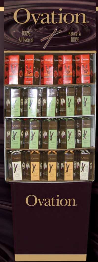
60 Count Floorstand 15 Cappuccino, 30 Mint, 8 Orange, 7 Irish Cream 60/4.4 oz (125g)