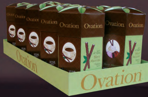
Mint Display 10/4.4 oz (125g)