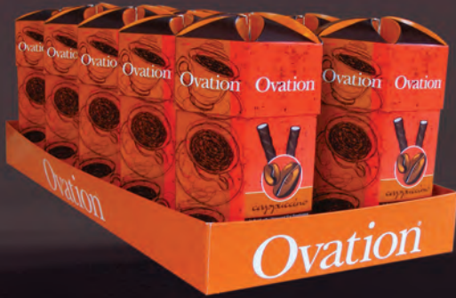
Cappuccino Display 10/4.4 oz (125g)