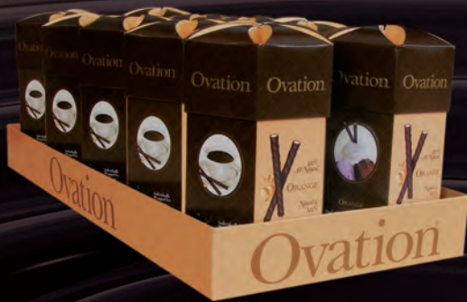
Orange Display 10/4.4 oz (125g)