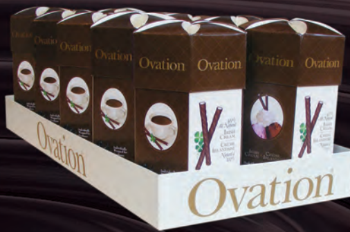
Irish Cream Display 10/4.4 oz (125g)